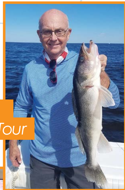
Ballard's Fishing Tour