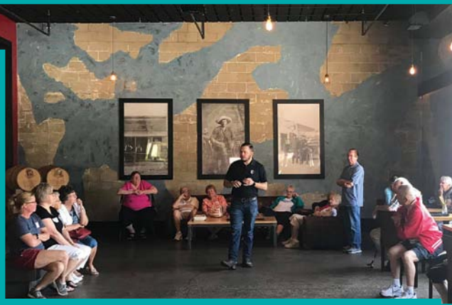
One Day Mystery Tour Kalona, IA