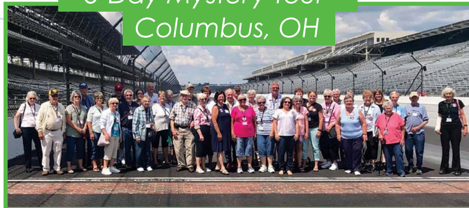
5-Day Mystery Tour Columbus, OH