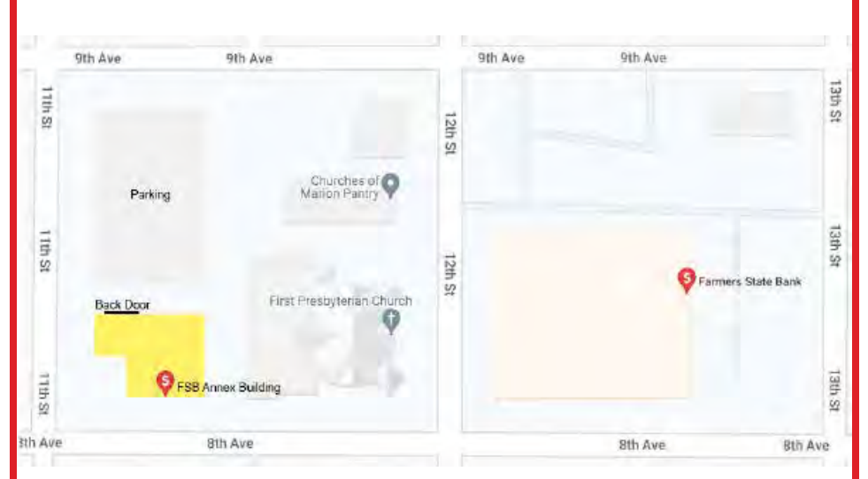
FSB ANNEX 1100 8th AVE MARION, IA 52302